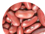
Kidney LIGHT RED