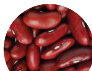
Kidney DARK RED